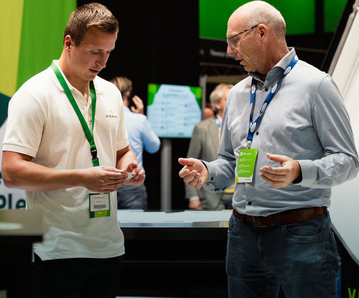
Exhibit at the specialised exhibition for sustainable heating, cooling and ventilation.